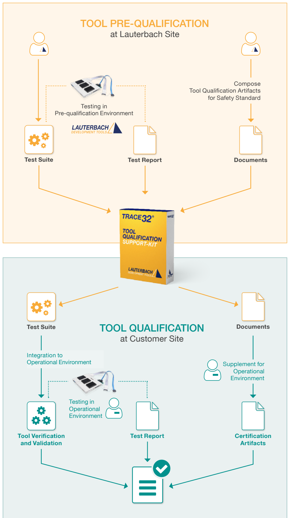
Figure 1: The 2-stage qualification process

IEC 61508 is a basic safety standard that covers the functional safety of electrical, electronic, and programmable electronic systems, irrespective of the application.