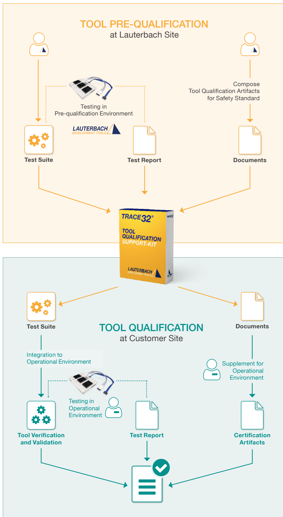
Figure 1: The 2-stage qualification process

IEC 61508 is a basic safety standard that covers the functional safety of electrical, electronic, and programmable electronic systems, irrespective of the application.