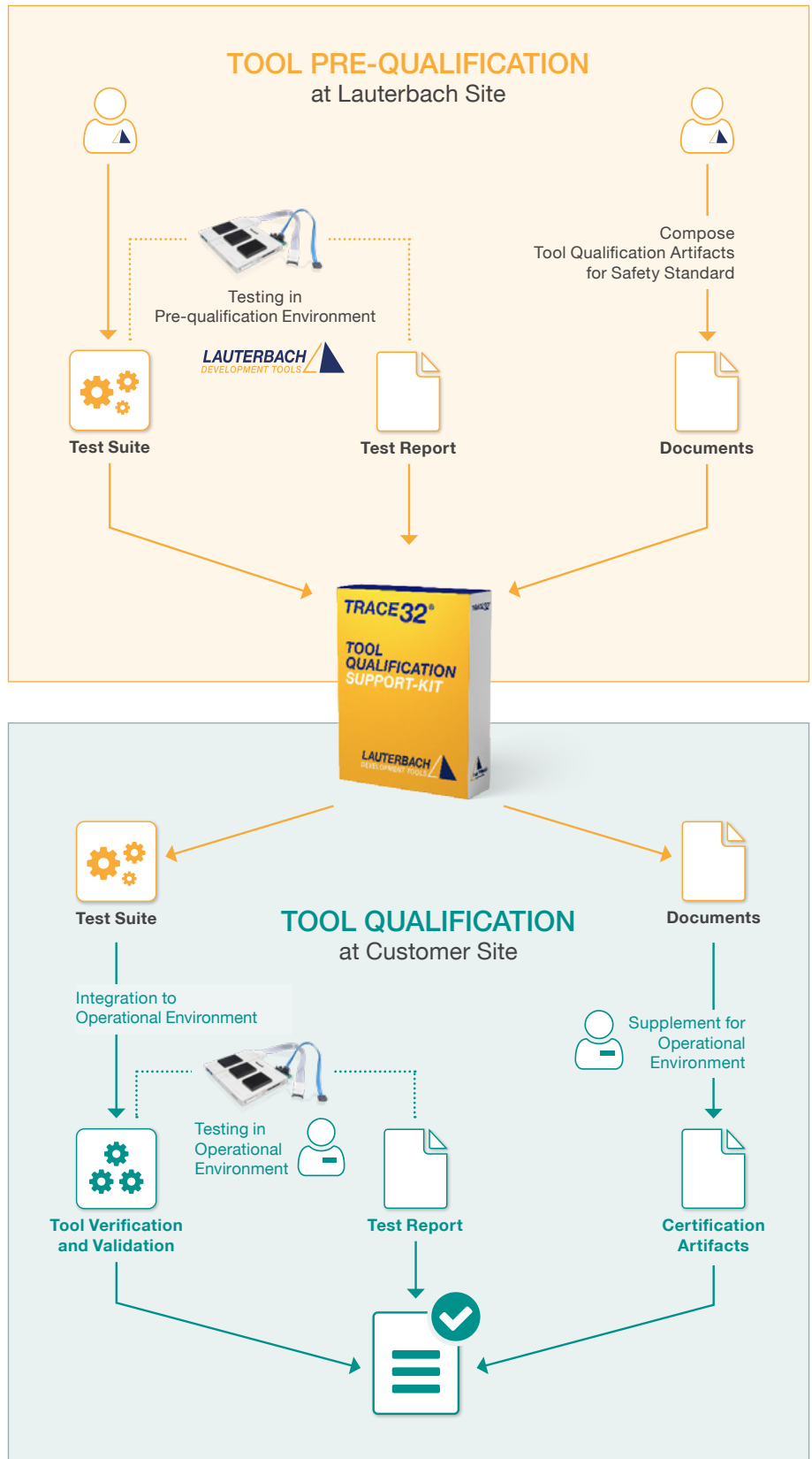
Figure 1: The 2-stage qualification process

ISO 26262 is intended to be applied to safety-related systems that include one or more electrical and/or electronic (E/E) systems and that are installed in series production passenger cars with a maximum gross vehicle mass up to 3.500 kg.